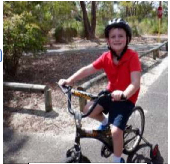
Karter's favourite activity