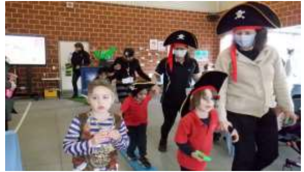
Room 1 and 2 walking the plank