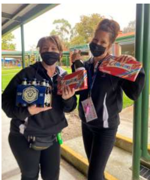
Raffle Prize Winners